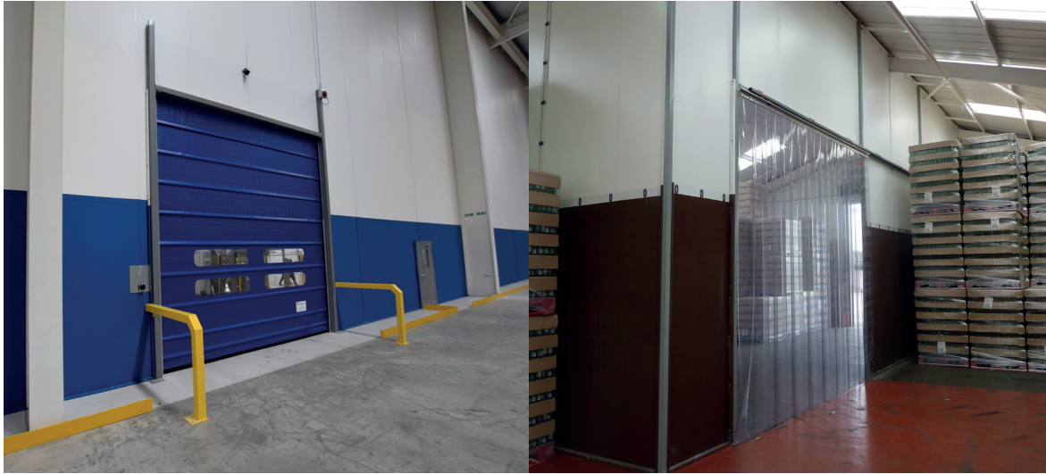
Fastflex® – fast action doors

Our partitioning range includes a variety of door, access and crash barrier add-ons. Enhance your solution to improve workplace functionality and efficiency. Add additional safety and security protection, maintain temperature, stop heat loss, reduce noise pollution, prevent cross-contamination, and shield personnel. We deliver customised integrated solutions for your individual project, removing the need for you to connect multiple suppliers.