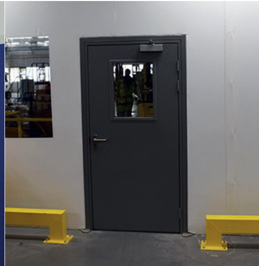
Anchorwall® – steel pedestrian doors

For heavy usage areas, choose high impact resistant and low abrasive wear full rubber panels.