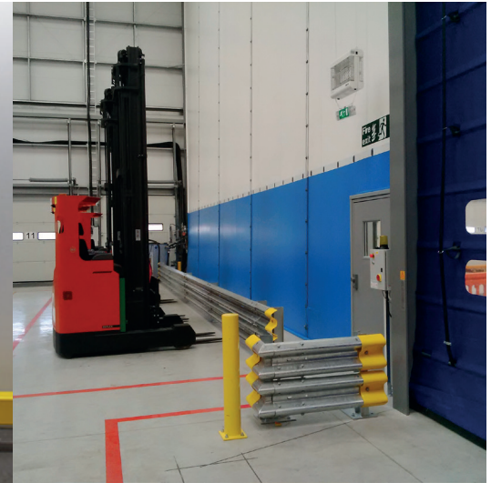
Easiguard® – crash barriers

Customise your doors further colour options, glazing panels and digilocks to provide additional security and create restricted access zones.