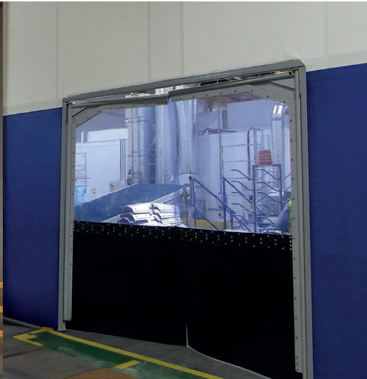
Flexidoor® – crash doors

Include vision panels for line of sight, and wind load straps can also be included for external applications in high-wind locations.