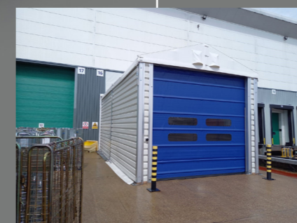
Flexistrukture – airlock using Fastflex doors