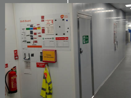
Hoardfast – part-height free-standing or floor-to-ceiling hoarding