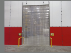
Flexistrip – PVC strip door