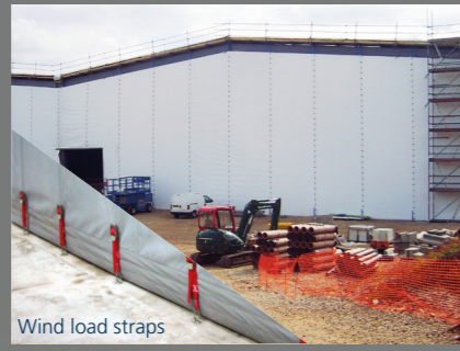
Flexiscreen – temporary screen for internal or external building works