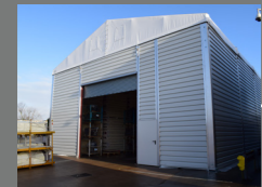
Flexistrukture – create extra space