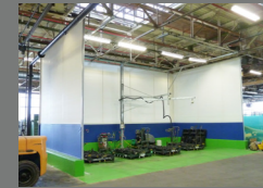
Flexiwall – washdown bay