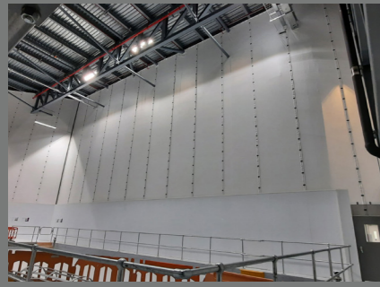
Flexiscreen – temporary screen for refurbishments or line relocation work