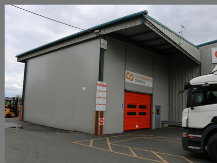
Flexiwall – external use for enclosing canopies