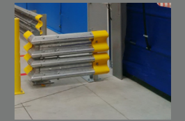
Easiguard – crash barriers and bollards