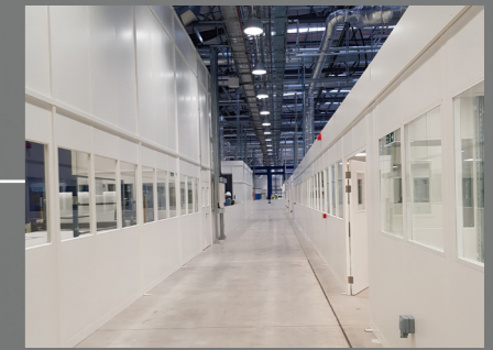
Anchorwall – create offices and partitions