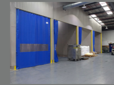
Flexicurtain – curtain door