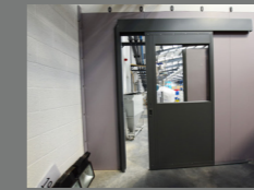
Anchorwall – steel pedestrian door