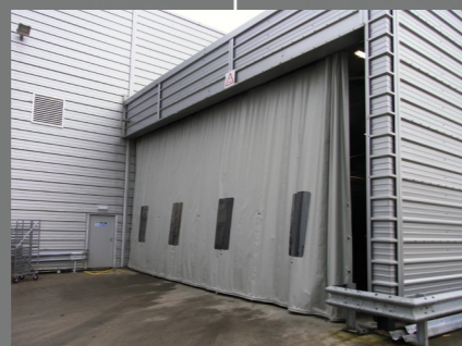
Flexicurtain – external curtain, fixed or railed