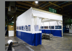
Flexicurtain – internal enclosures and partitions