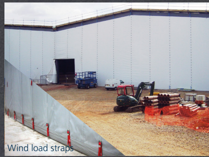
Flexiscreen – temporary screen for building works (from the outside)