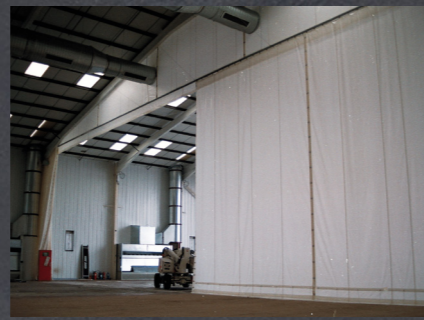
Flexicurtain – industrial retractable curtain wall