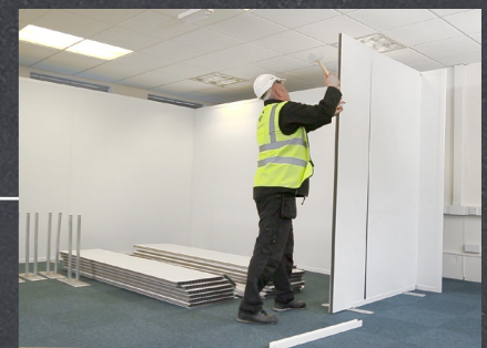
Our hoarding is quick and easy to assemble