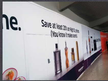
Hoardfast Standard uPVC – temporary screen for refurbishment and renovation works