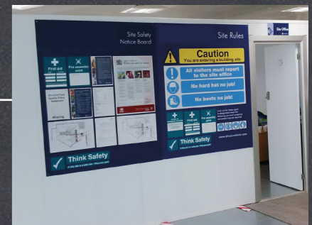
Hoardfast – create temporary site offices and welfare spaces