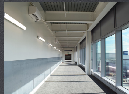
Hoardfast – create temporary tunnels and walkways to enhance passenger experience