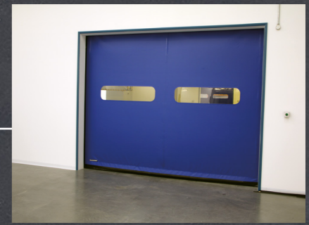
Fastflex fast action doors – for internal or external use