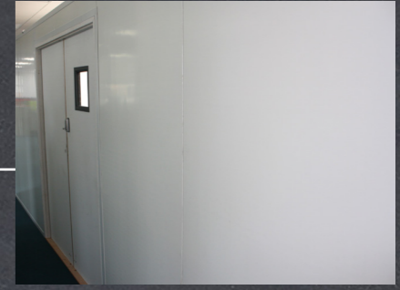
Hoardfast Firescreen – temporary 60 minute fire rated hoarding