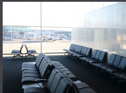
Maintain passenger experience during fit out, renovation and construction projects