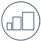
Range of Panel Sizes