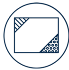
Range of Finishes