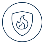
Fire Rated Panels on Request